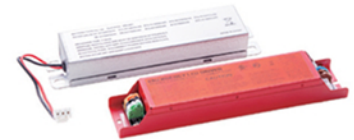
90 Minute battery option