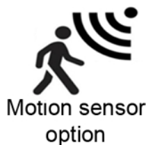
Motion sensor option